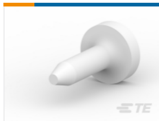
TE Part # 206509-1 SIZE 20 KEYING PLUG